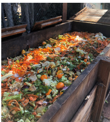
Worm Bin