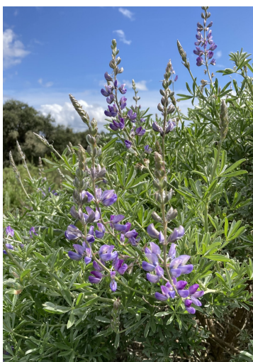
Bush Lupine Lupinus longifolius Along upper loop road

Excerpted from A Naturalist at Play , by Vern Human. This seemed particularly appropriate to include since a number of wildflowers are currently in bloom at the Mission.