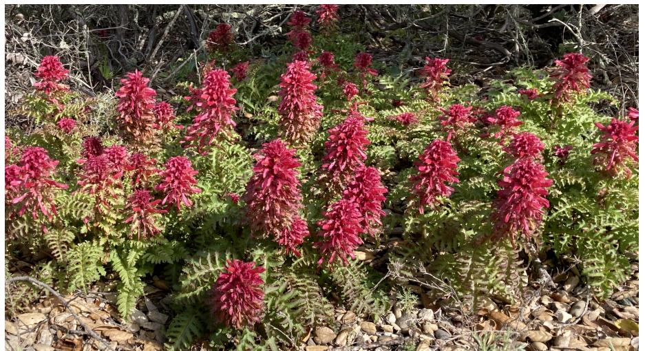
Warrior's Plume, Pedicularis densiflora at La Purisima Mission